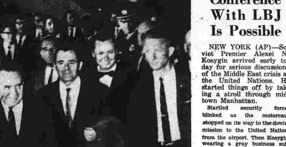
Soviet Premier Kosygin acknowledges cheers from onlookers this morning as he leads a Soviet delegation from Kennedy Airport terminal. The Russian flew here to attend a special U.N. General Assembly meeting on the Middle East problems.

WASHINGTON (AP) - Wary top Democratic newsmen Bennett said today that the Senate would block an attempt by Sen. Russell B. Long, D-La., to force an immediate vote on what many senators view as the lesser of two evils.